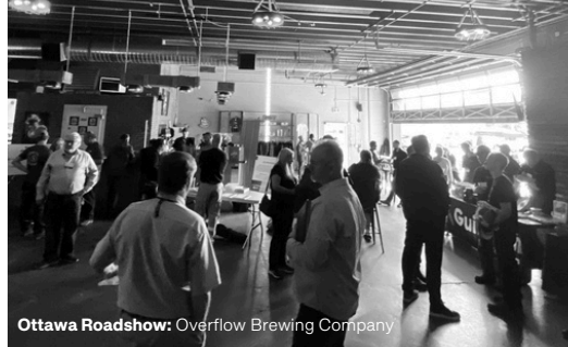
Ottawa Roadshow: Overflow Brewing Company