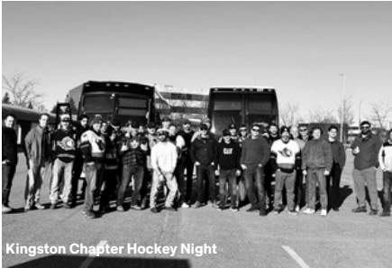
Kingston Chapter Hockey Night