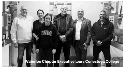
Waterloo Chapter Executive tours Conestoga College

The Waterloo Chapter donated $1,500 in the form of three $500 scholarships to be awarded to deserving Level 3 students at Conestoga College.