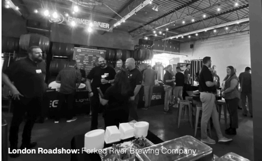
London Roadshow: Forked River Brewing Company