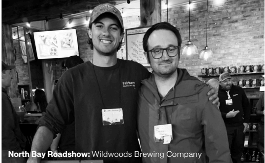
North Bay Roadshow: Wildwoods Brewing Company