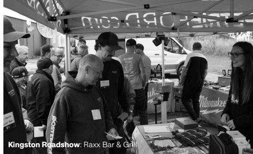
Kingston Roadshow: Raxx Bar & Grill