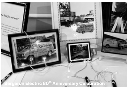
Bergeron Electric 80 th Anniversary Celebration

Bergeron Electric based in Cornwall, a long-time OEL Member, celebrated 80 years in business this year, commemorating a legacy in Ontario's electrical industry since 1945.