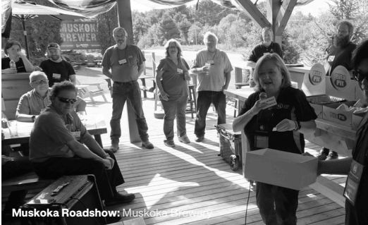
Muskoka Roadshow: Muskoka Brewery