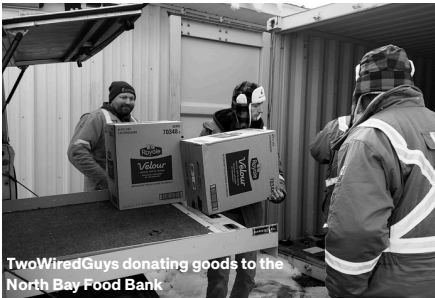
TwoWiredGuys donating goods to the North Bay Food Bank

The Kingston Chapter took a trip to Ottawa on April 17 to watch the Ottawa Senators play against the Carolina Hurricanes. 38 Members attended to watch the game together.