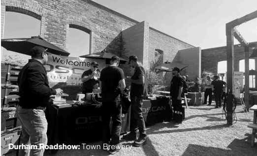
Durham Roadshow: Town Brewery