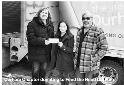
Durham Chapter donating to Feed the Need Durham

TwoWiredGuys in North Bay donated 689lbs of goods to the North Bay Food Bank and challenged fellow North Bay Chapter Members to follow suit.