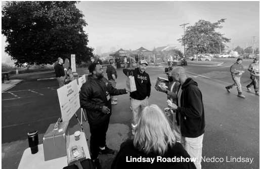
Lindsay Roadshow: Nedco Lindsay