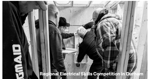
Regional Electrical Skills Competition in Durham

In February, the Durham District School Board hosted a regional skills competition. Several of the Durham Chapter Members participated by contributing materials, donations, and providing coaching to the students.