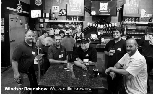
Windsor Roadshow: Walkerville Brewery