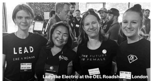
Ladylike Electric at the OEL Roadshow London

Ladylike Electric, an OEL Member based in Kitchener, celebrated its first year in business this June. We are proud to represent them as our first all-female electrical contractor Member.