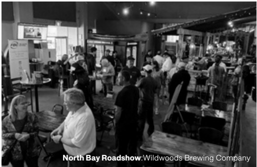
North Bay Roadshow: Wildwoods Brewing Company