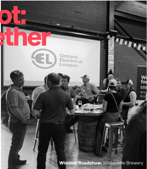
Windsor Roadshow: Walkerville Brewery

We're doing it again this September, 2025. We hope to see you there!