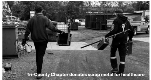
Tri-County Chapter donates scrap metal for healthcare

The Tri-County Chapter in Brantford hosted a Weigh & Pay Community Day on May 24 in partnership with Combined Metal Industries Inc. (CMI) and the Brant Community Healthcare System (BCHS) Foundation. $2632.11 worth of scrap metal was raised, all of which was donated to local healthcare.